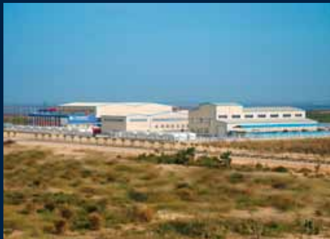
Fassmer-Marland China | Zhongshan