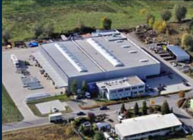
Fassmer Germany | Rechlin

Fassmer-Marland in Guangzhou, China, is a joint venture set up in 2005. The newly built and equipped office and production facilities are focused on the production of lifeboats, davits and boarding systems, primarily for the Asian market.