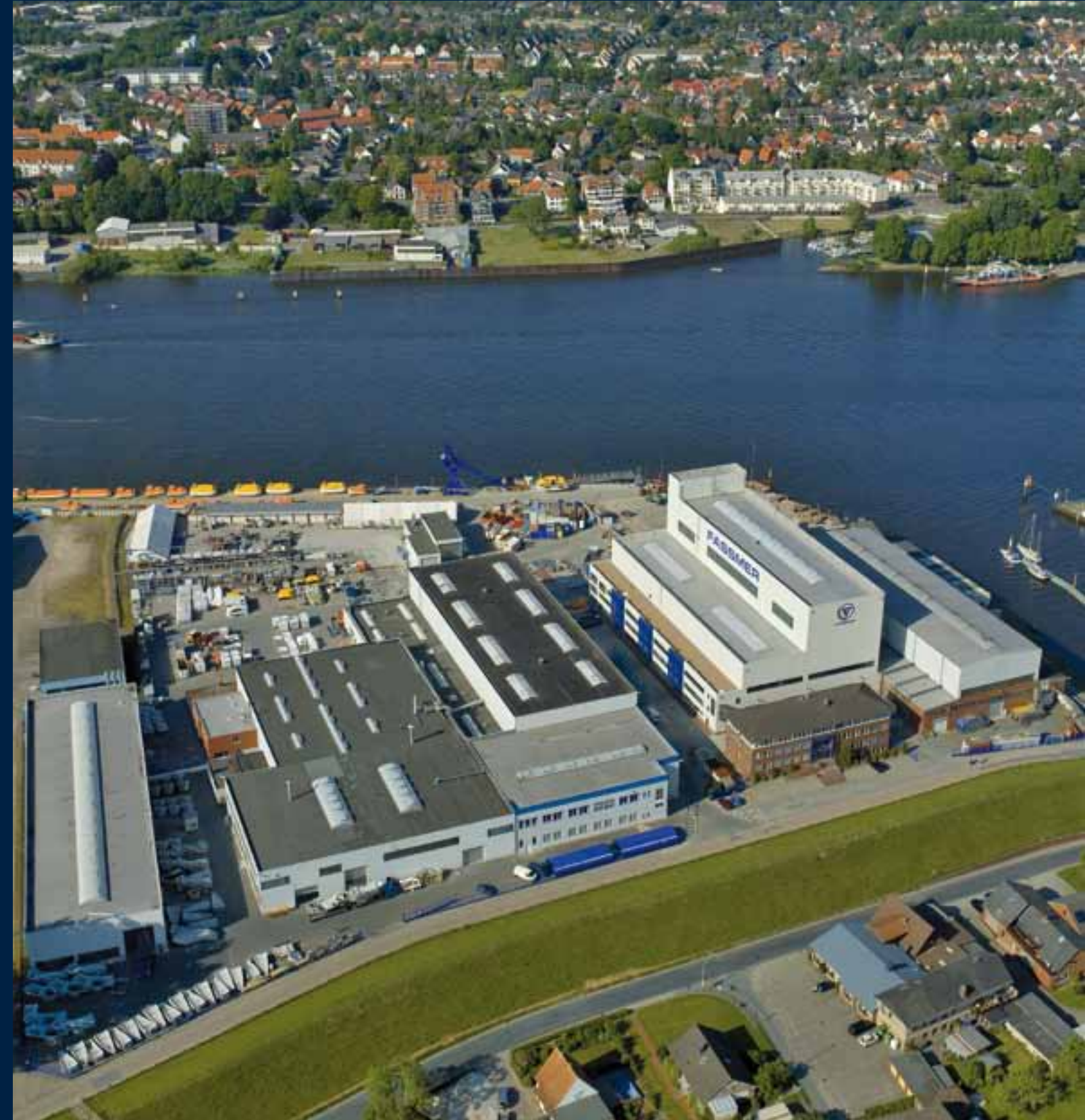
Fassmer Headquarters Germany | Berne